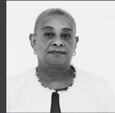
BARONESS DOREEN LAWRENCE OBE