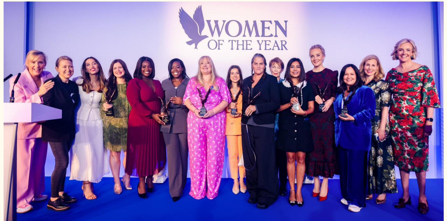
A selection of our winners and presenters from 2024:

In a world that often celebrates 'celebrity' – Women of the Year sets itself apart by honouring real achievement and diversity.