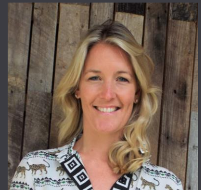
LADY EDWINA GROSVENOR