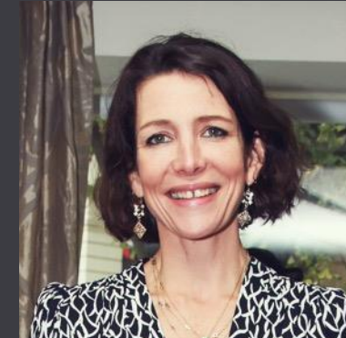
THOMASINA MIERS OBE