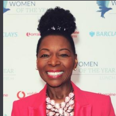
BARONESS FLOELLA BENJAMIN OM, DBE, DL

Our volunteer Nomination Committee of 60 diverse women, representing various networks, perspectives, and life stages across the UK, submits nominations for ten extraordinary women each year. Our judging panel then faces the difficult task of narrowing this list down to approximately 400.