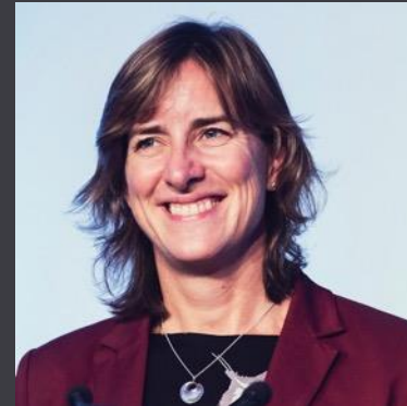
DAME KATHERINE GRAINGER DBE